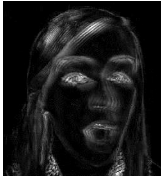
Figure 2: Five-frame composite visualization of the speaker’s head and facial movements as captured by movement amplitude across the first peak shown in Figure 1.

In processing our data we also convert MA measurements to z-scores per speaker to allow for comparable measurements in spite of differences across recording conditions such as speaker distance from the camera, color of the background and speaker clothing, and so on. As with our acoustic variables, for each video we extract an MA maximum, mean, minimum, and standard deviation for each PBU.