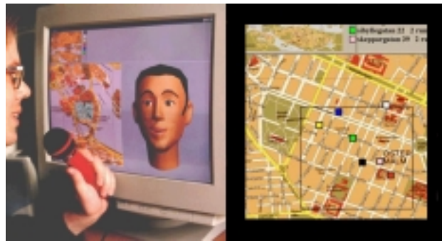
Figure 1. A user interacting with the AdApt System and a closeup of the interactive map with apartment icons.

AdApt is a Swedish conversational multimodal dialogue system which can be used for accessing information about apartments for sale in downtown Stockholm. Figure 1 shows the system's graphical user interface. It consists of the animated talking agent Urban, an interactive map of Stockholm and a table for displaying textual information. The AdApt corpus comprises 50 dialogues with 33 subjects, all collected in a series of Wizard-of-Oz experiments. The total number of utterances in the corpus is 1845. The subjects were given pictorial tasks that involved finding one or several apartments in Stockholm that fulfilled certain criteria. To solve these tasks, the subjects were asked to take their time to look around, and to compare different apartments in order to find a suitable one. The tasks were deliberately designed to be vague, so that the subjects' linguistic behavior would be as natural and unconstrained as possible. In the course of these experiments, an open microphone was used to facilitate the integration of speech and