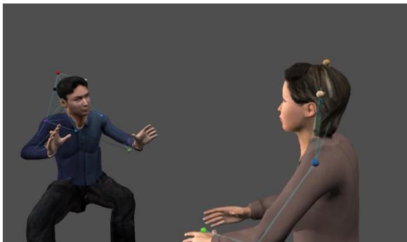
Figure1: 3D viewer for manual annotation.

annotators. To carry out the classification, the annotators viewed each segment in a specially designed 3D player which plays time-synchronized audio and displays 3D point data of the motion capture markers together with animated characters following the 3D marker motion, see figure 1. This was done to enable the annotators to work on the same signal as the algorithm. In addition, the 3D-player allows for alternate view-points of the scene and maintains the high frame rate of the motion data. In some uncertain cases the annotators also used the video data as a reference. In future releases we plan to include this feature in the player.