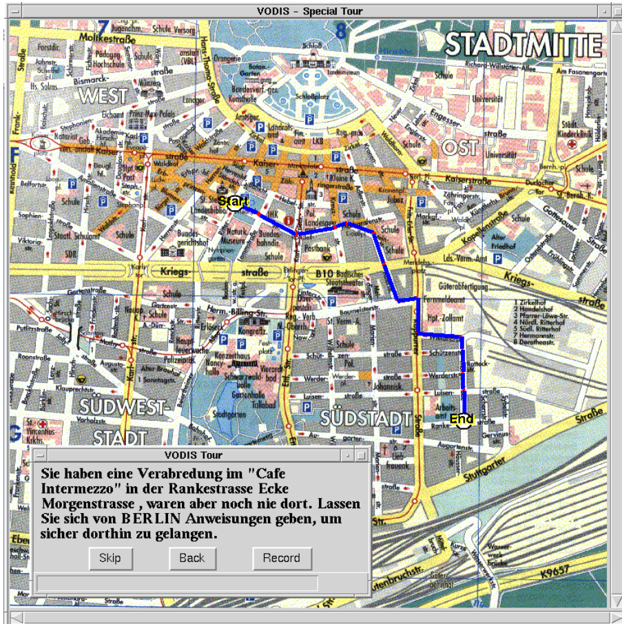
Figure 1: Example prompt of the Data Collection Tool used to simulate a navigation system

underlying semantic grammar is used. Both speech recognition system and parser were also trained to be able to handle spontaneous speech effects as coughing, laughter, lip smacks, breathing and so on.