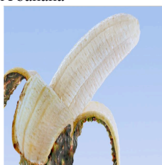
Figure 2: Image used for eliciting uncertainty with the “banana” sentence.