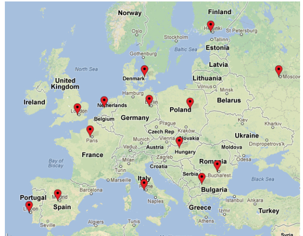
Figure 2: Demo screenshot: this geographical interface to voices can be found at http://tundra.simple4all.org/demo .

Static and interactive demos of the resulting voices are available at http://tundra.simple4all.org/demo . A screen shot of the geographically-organised demo page is shown in Figure 2.