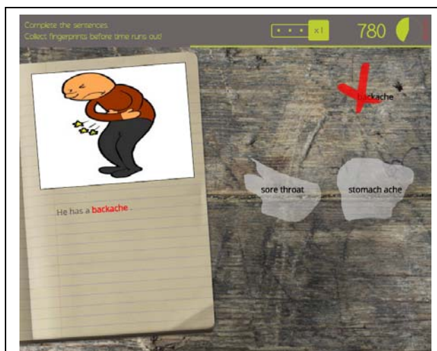
Figure 1: Example of a Fingerprints (FP) exercise. The user could select one of the shown answers (fingerprints). The wrong answer was chosen. The top bar provides (left to right) a) a brief explanation of what to do; b) the score multiplier (assigning extra-points after three consecutive right answers); c) the current score, and d) a pie chart-like indicator showing how much time is left (in green).

and that some games were perceived more as exercises than as games. Students also complained about poor graphics and the lack of immediate feedback.