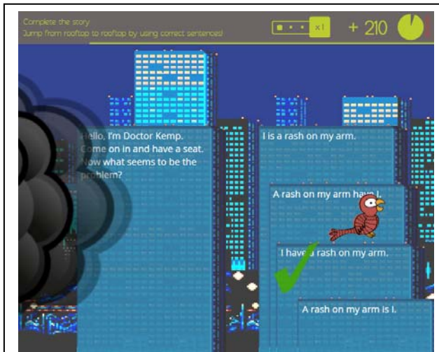
Figure 3: Example of a Roof-surfing parrot (RP) exercise. The user chose the right answer and the parrot jumped from the ‘question’ skyscraper to the skyscraper with the right answer, thus distancing himself from the approaching dark cloud. The top bar provides (left to right) a) a brief explanation of what to do; b) the score multiplier (assigning extra-points after three consecutive right answers); c) currently gained points, and d) a pie chart-like indicator showing how much time is left (in green) before the dark cloud reaches the parrot.