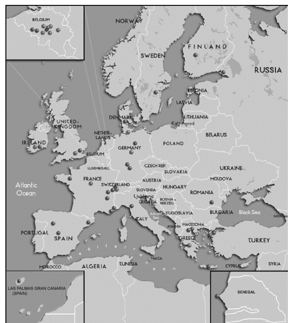
Figure 2. SIMILAR on the map

The SIMILAR institutions are spread all over Europe and were chosen for their skills and excellence in signal processing, in human-computer interaction or both. From Senegal to Finland and from Canarias to Saint Petersburg, SIMILAR is covering the Europe at large and even a little more. The taskforce gathers 32 research institutions and has more than 20 privileged contacts in the industry, large companies like EADS-airbus or small SMEs active in the multimodal interfaces business.