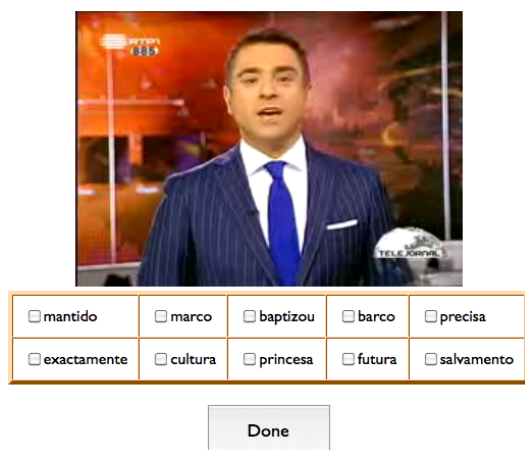
Figure 2: Interface for the search “barco” (boat) for Set 5.

nificant pauses, and for that reason, may be viewed as an approximation to clauses.