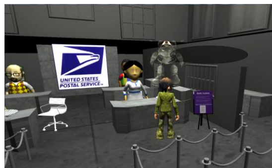
Figure 1: Game Screen in the Post Office

The DEAL, a spoken dialog system developed at KTH, using